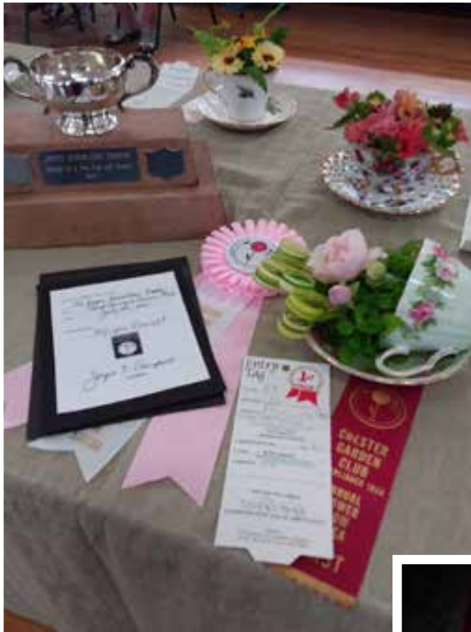
The Chester Garden Club held an impressive flower show (above and left) and members collaborated to produce jars of delicious homemade jelly! (below)