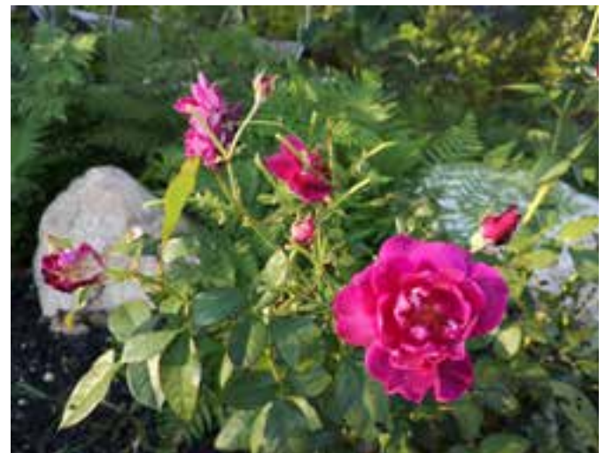
Exploring the community gardens at the Bear River First Nation