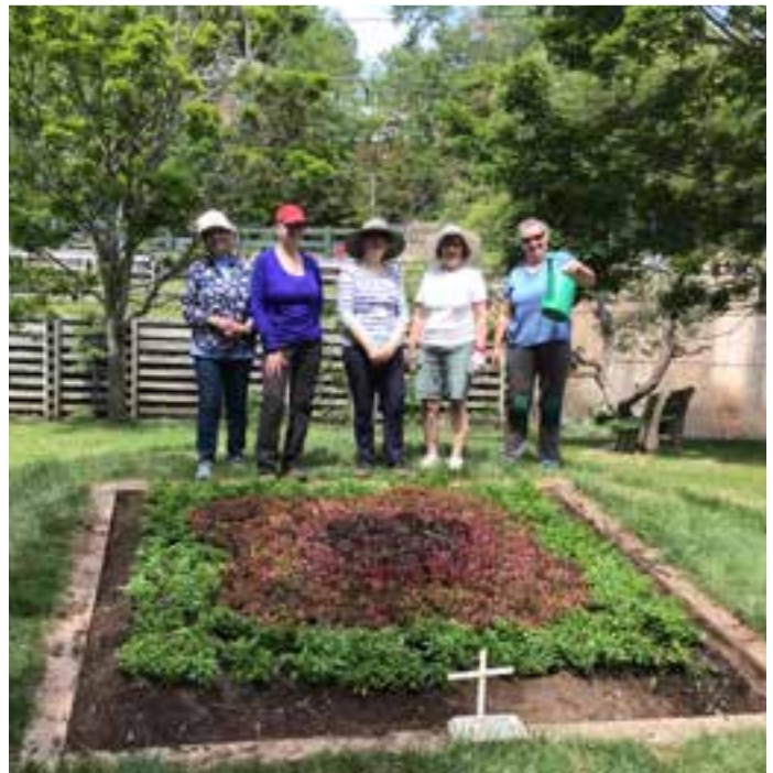
Bedford club members bring the Cenotaph Garden to life. (top and right) A few weeks later the garden is thriving. (below)