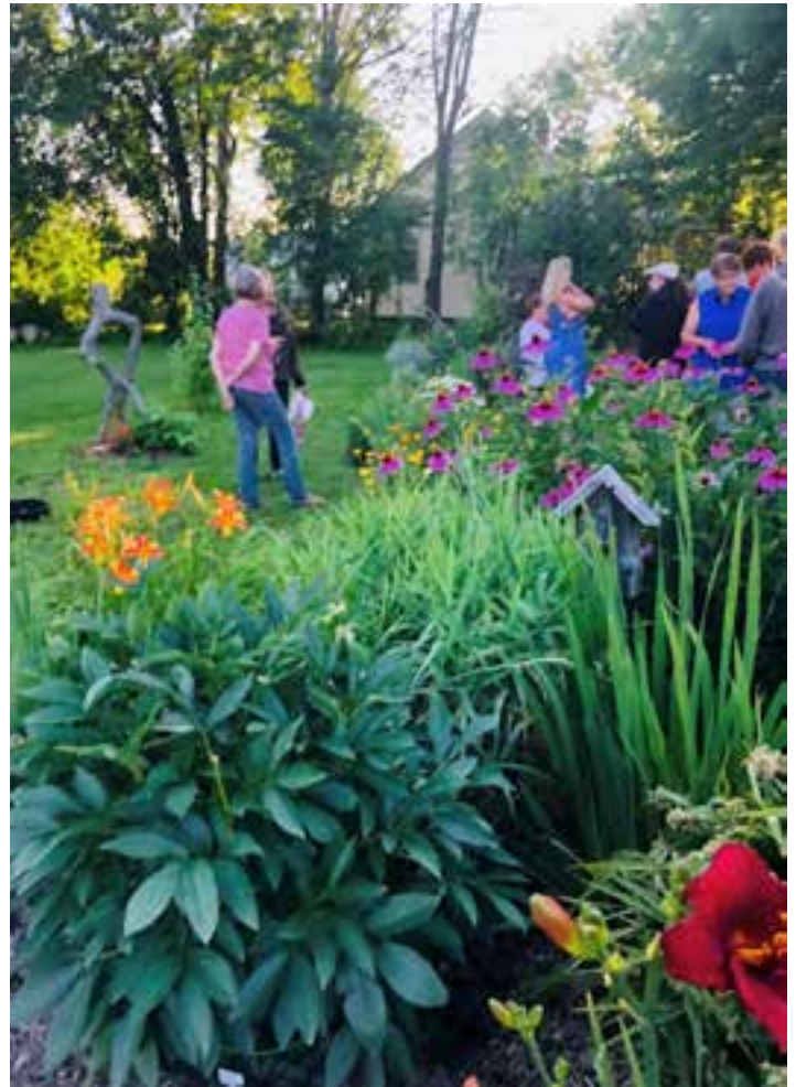
Club members meander through a beautiful garden.

Our Club is ramping up for an exciting year, with featured speakers and workshops. We are especially motivated to grow our membership and encourage involvement in the community.