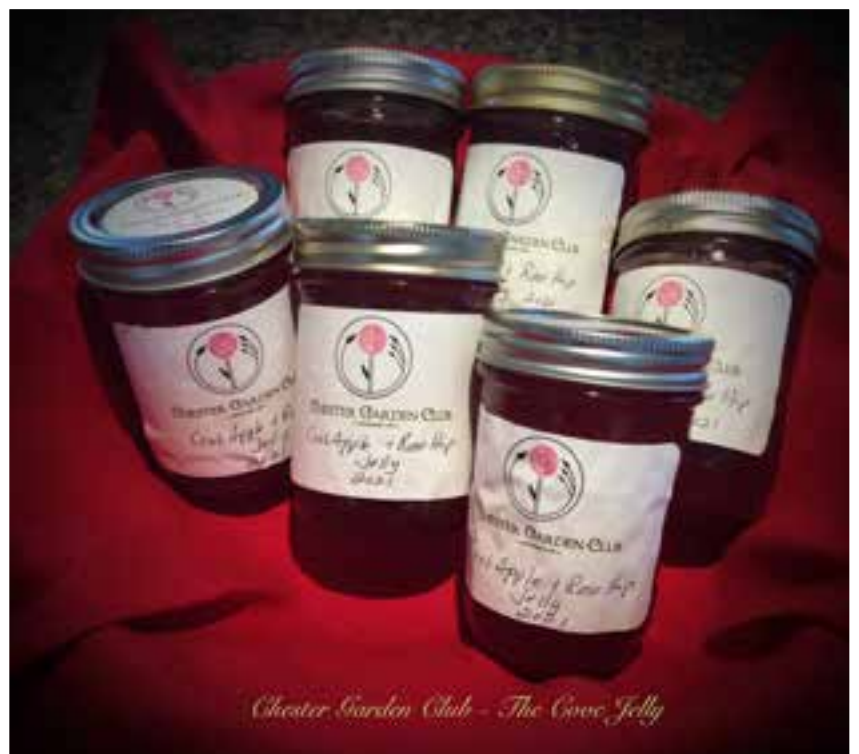
Chester Garden Club - The Cove Jelly