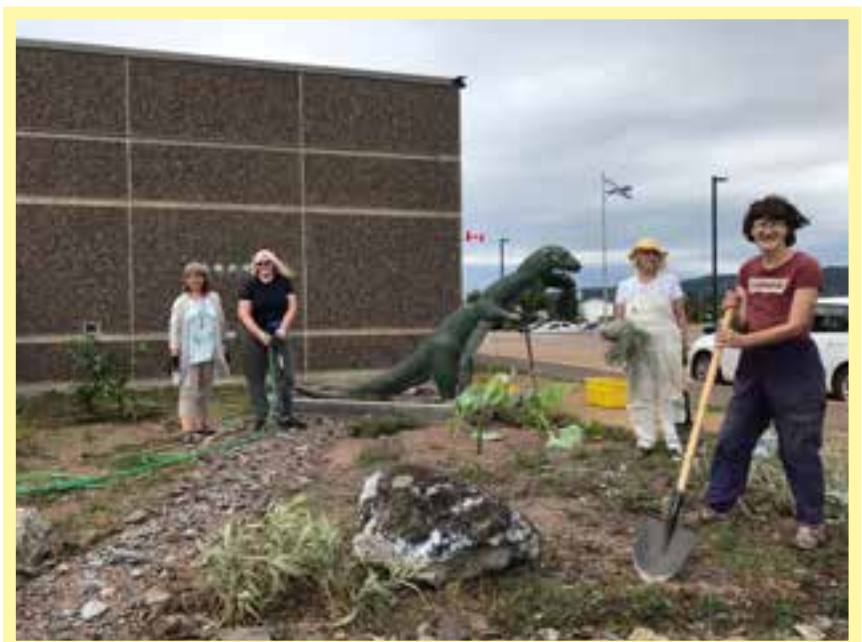
Club members at work in the new garden for Dino

The cement Dino has had epoxy teeth and claws sculpted back on, and is now waiting for a new coat of paint! The Parrsboro Garden Club sees this as a work in progress, which will take another year or two to complete. Or is a garden ever completed?