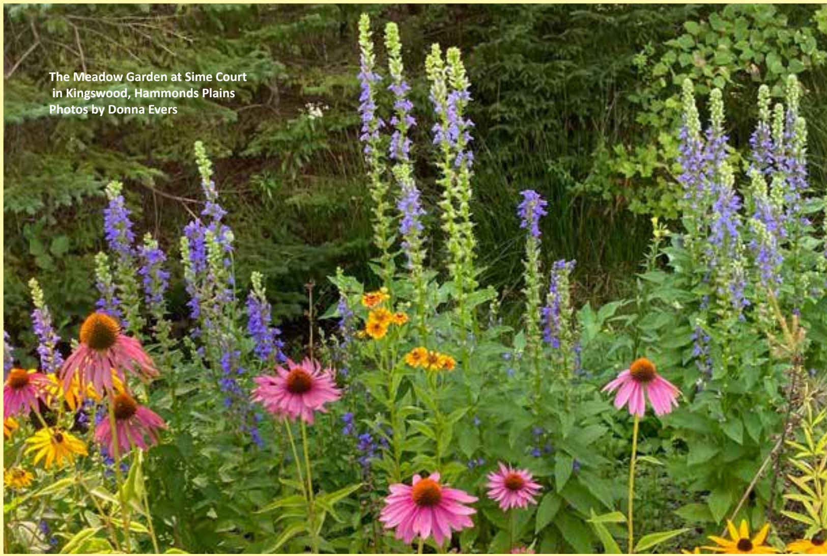
The Meadow Garden at Sime Court in Kingswood, Hammonds Plains Photos by Donna Evers