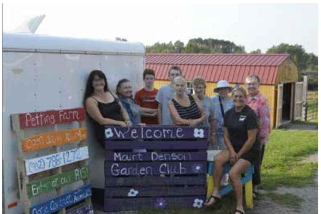
A group of happy Mount Denson Garden Club members at the Dragonfly Haven Therapeutic Farm