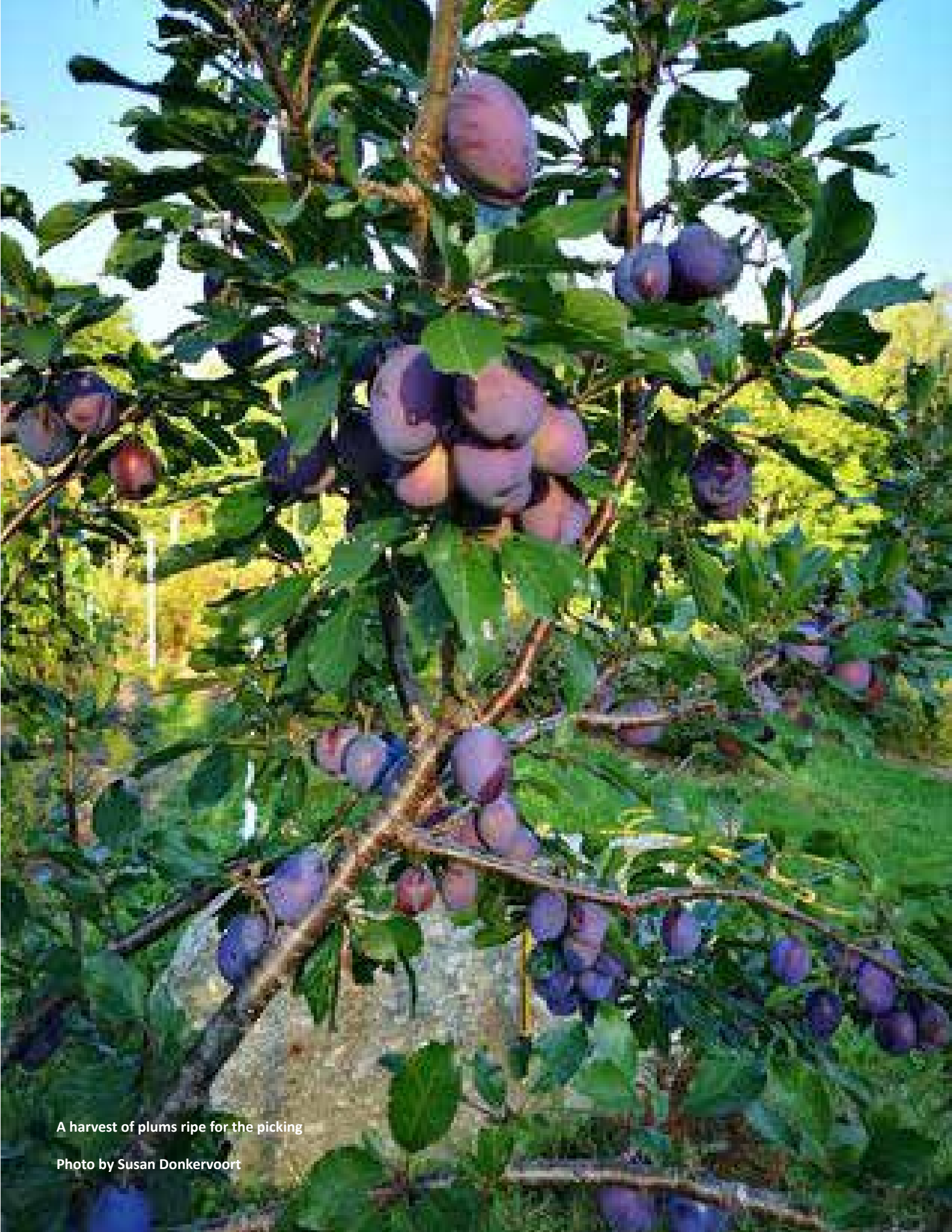
A harvest of plums ripe for the picking