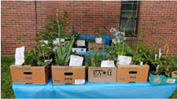
Dartmouth Horticultural Society holds a unique and very successful plant sale.

This sale was more about mental health, keeping members involved in the club, keeping our club name out there and doing something garden-oriented despite Covid. We sold about 700 plants, made a nice profit and also found a wonderful new venue in the process! We look forward to a real in-person sale again in 2022.