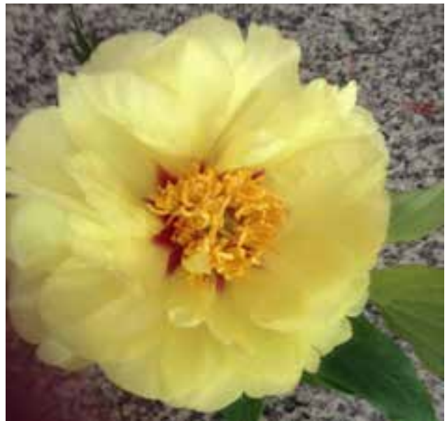
My tree peonies