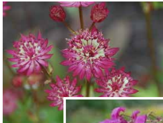
Astrantia or masterwort

To a new gardener I would say, start small, with a few pots—flowers or vegetables. Choose plants carefully, make sure they are healthy. Water regularly and don't forget to fertilize. See how you get along. If all goes well, go bigger the following year.