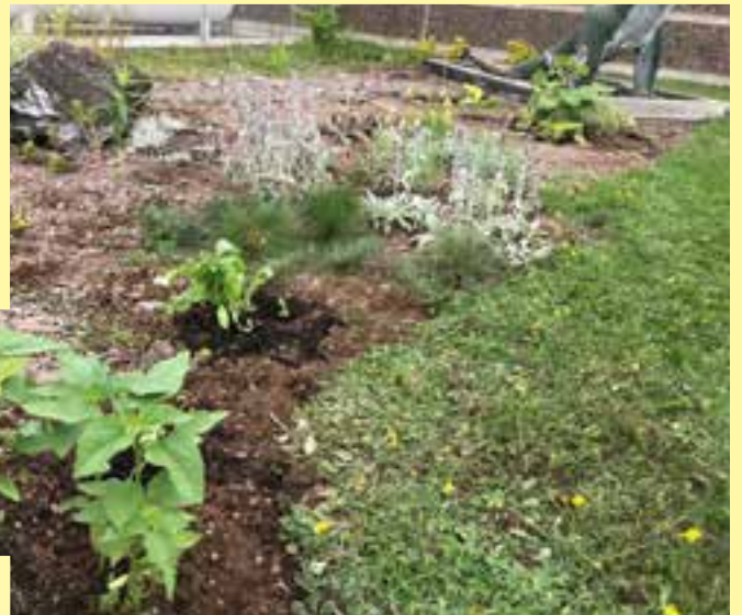
Sunflowers and Calendula , butterfly bush, grass tussocks (which are intentional) are planted in the new garden.