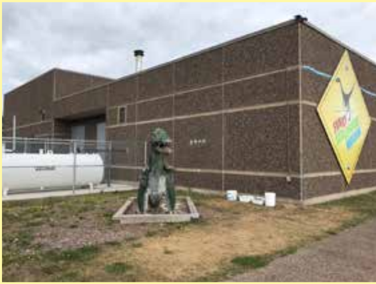
Dino stands watch outside the Fundy Geological Museum.