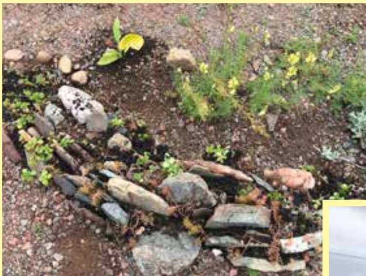
A rock garden curl provides a home for Sedum .